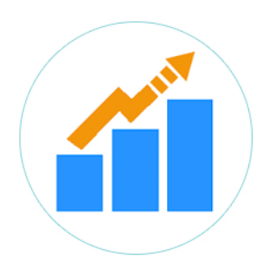
Experience exponential return on your marketing efforts.